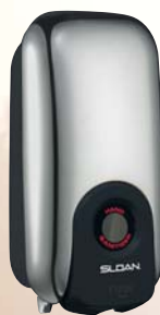
SJS-1400 Manual, wall-mount hand sanitizer dispenser